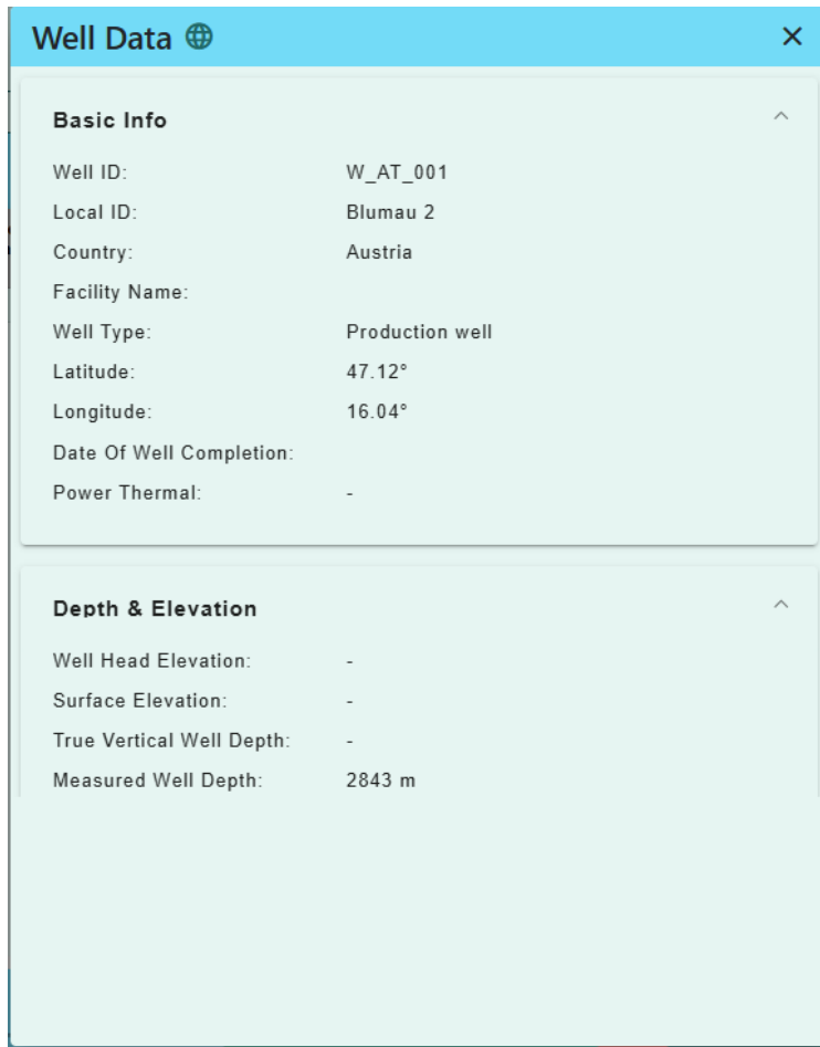
Figure 2. Data view window for wells